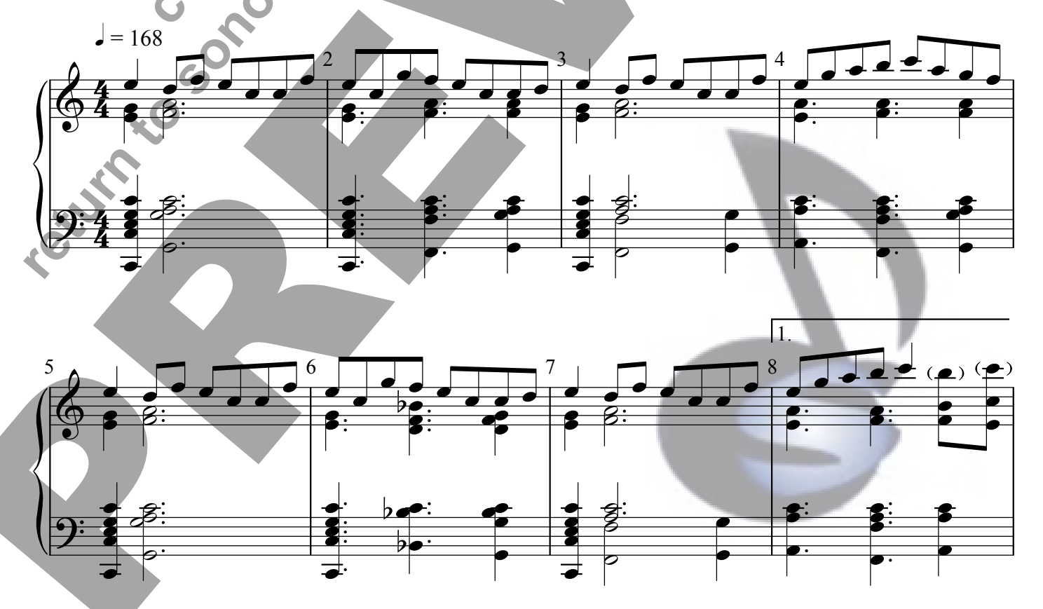
\begin{array}{c} \text{Copyright} \circledcirc 2007 \text{ - Sonology Music, LLC} \\ \text{This is not a master for reproduction; it has been purchased as an individual copy.} \\ \text{Copying prohibited.} \end{array}

3 octave choirs omit notes in ( ). 4 octave choirs omit notes in [ ]. Dynamics are left to the director's/ringers' discretion. 5 octave choirs may double melody an octave higher as desired, m. 1- 8 beat three (17 beat three for second ending). Performance tradition allows for free repetition of sections, so the DC is optional and may be used as many or as few times as desired.