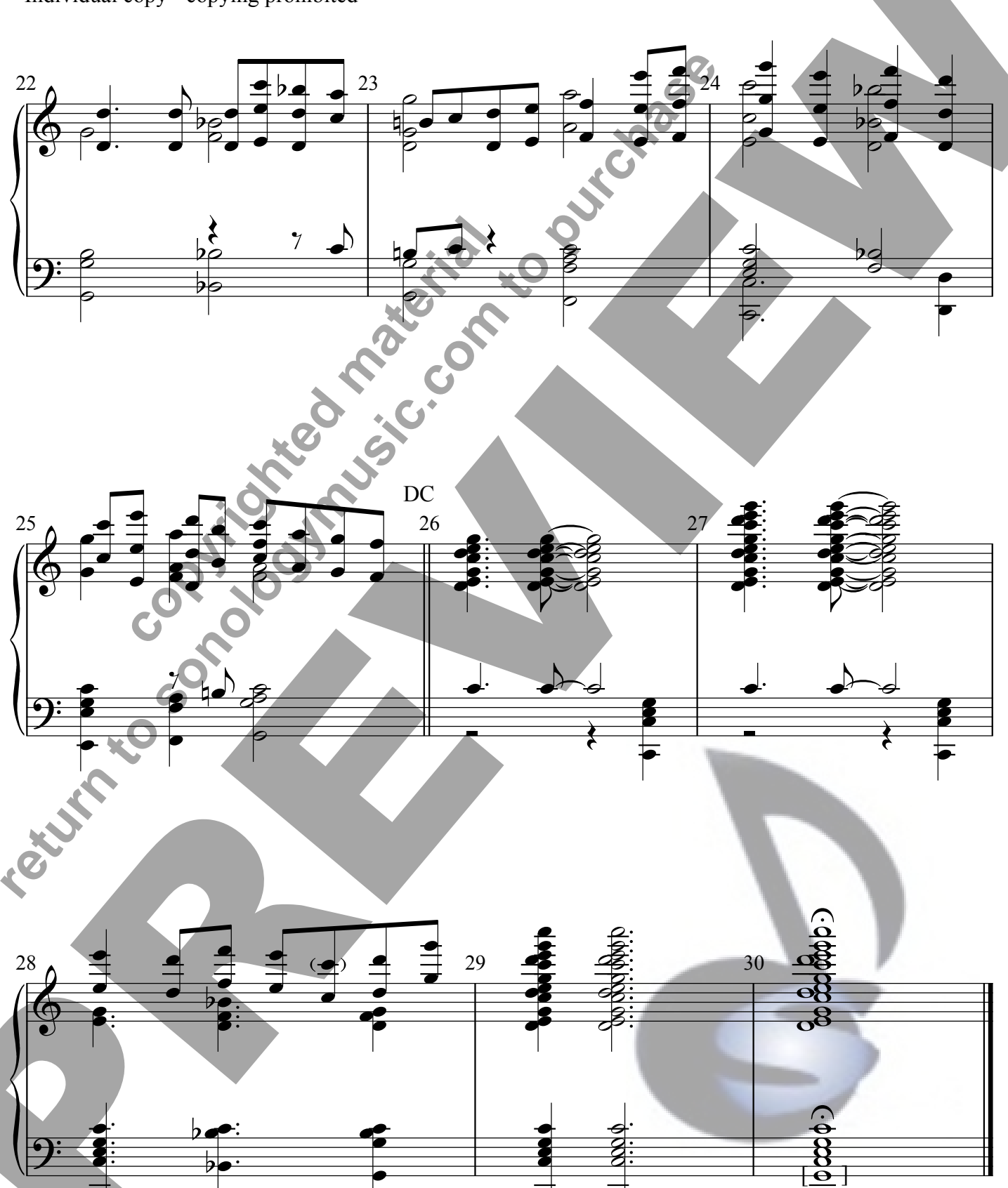
Mulqueen's Reel - arr. McChesney - 3-5 oct - page 3