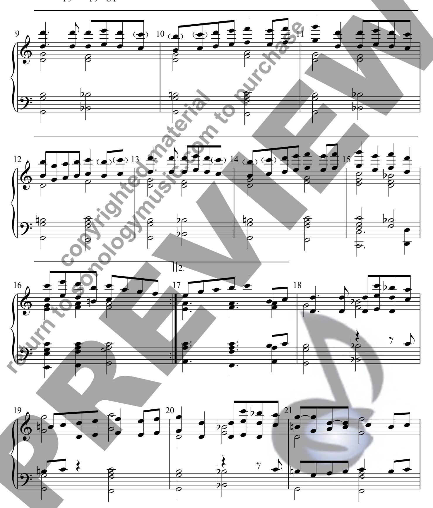
Mulqueen's Reel - arr. McChesney - 3-5 oct - page 2