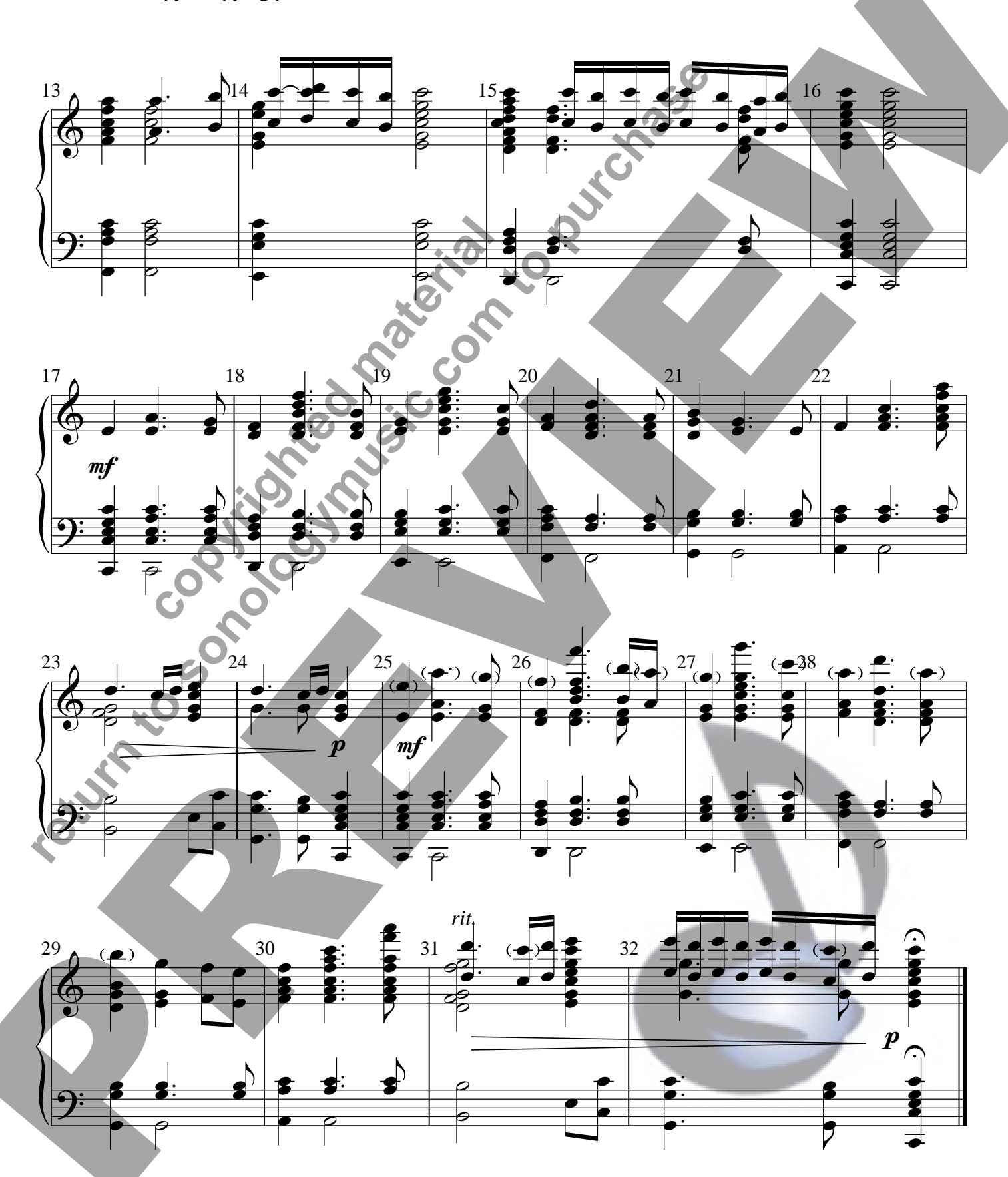
Sarabande - Pezel/Roth - Page 2