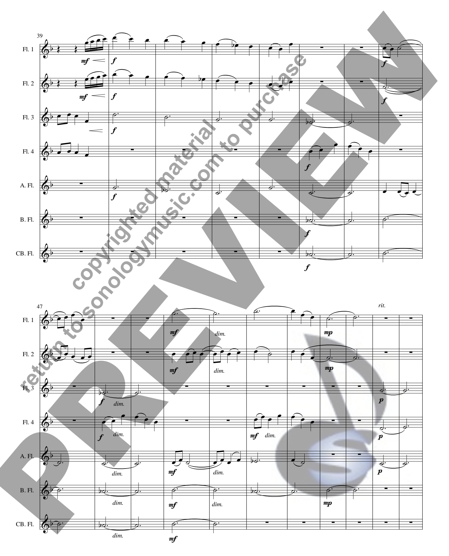
St. Francis Suite - II. Interlude - for Flute Choir - Kevin McChesney - Page 4