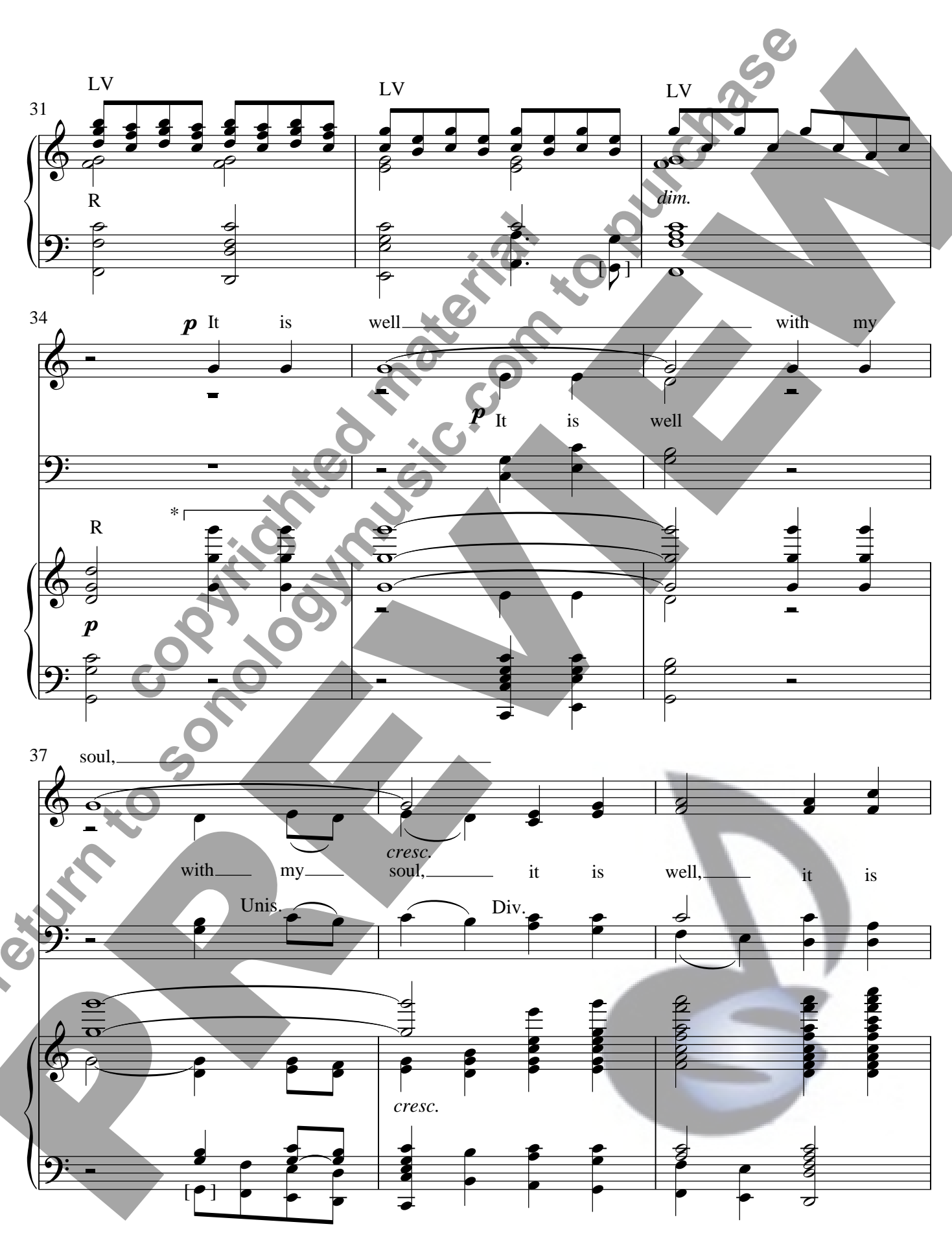
*Optional: Voices a capella (handbells tacet), m. 34 beat 3 through m. 41 beat 1. If using this option, handbells omit the whole note chord on beat 1 of m. 41 but play the rest of the notes in that measure.