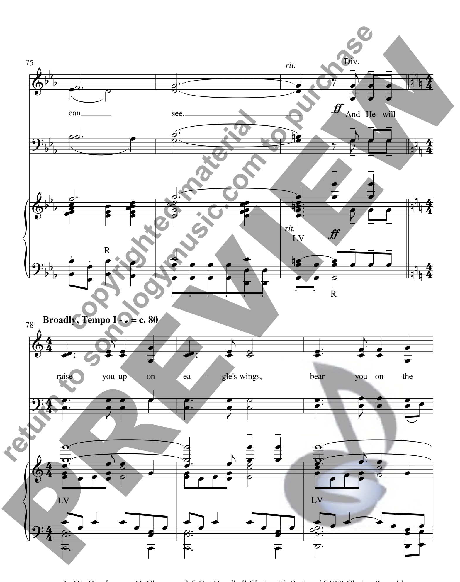
In His Hands - arr. McChesney - 3-5 Oct Handbell Choir with Optional SATB Choir - Page 11