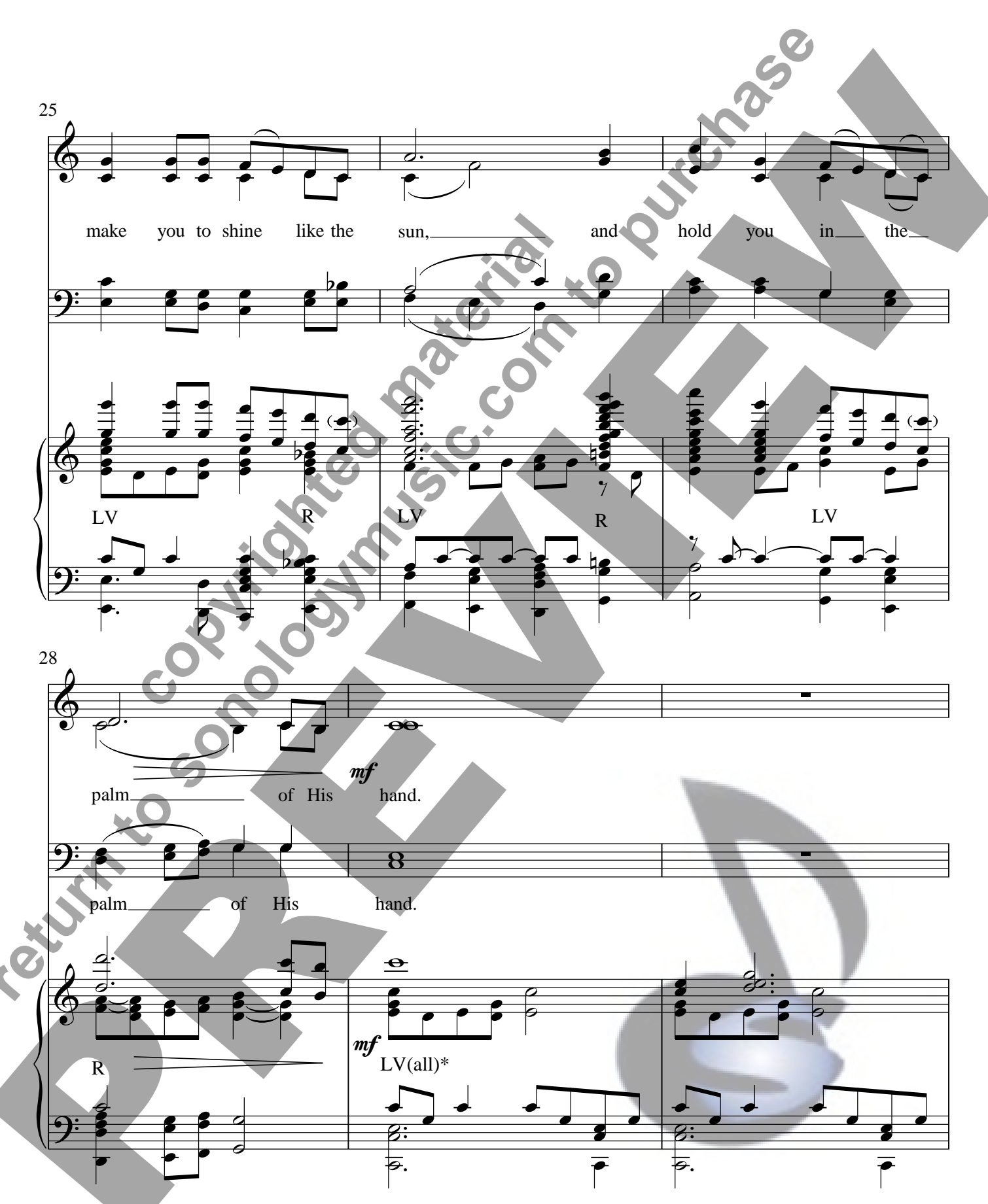
*All notes LV in m. 29-30 (as opposed to the common practice of having LV apply to the accompaniment while the melody or top voice rings and damps).