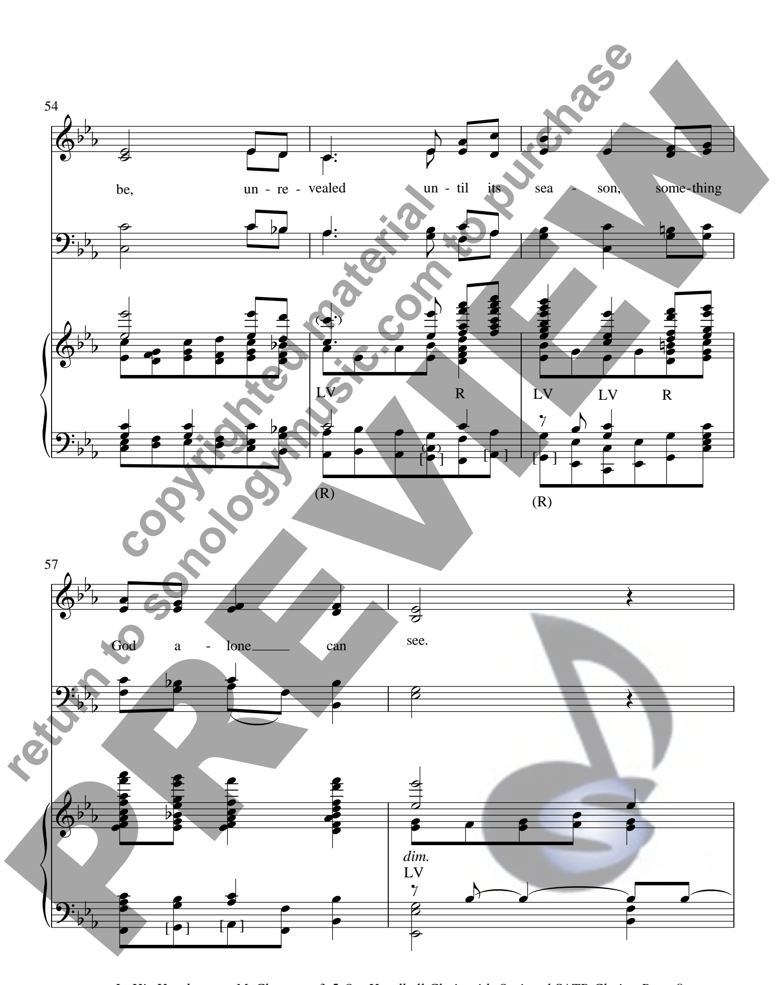
In His Hands - arr. McChesney - 3-5 Oct Handbell Choir with Optional SATB Choir - Page 8