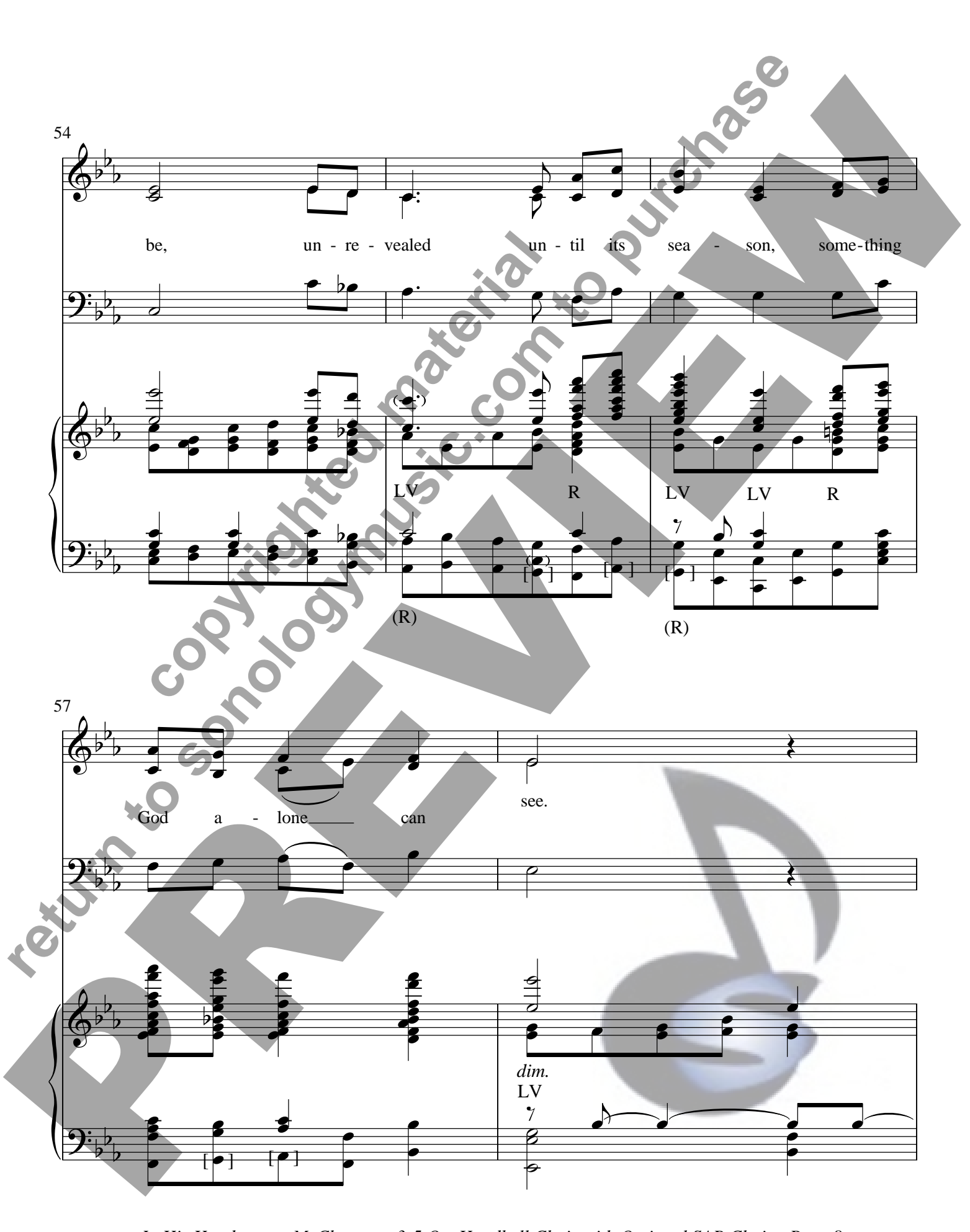
In His Hands - arr. McChesney - 3-5 Oct Handbell Choir with Optional SAB Choir - Page 8