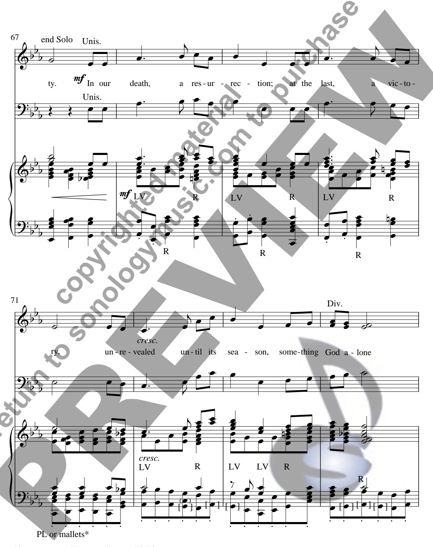
*Staccato notes PL or mallets, m. 72-78.