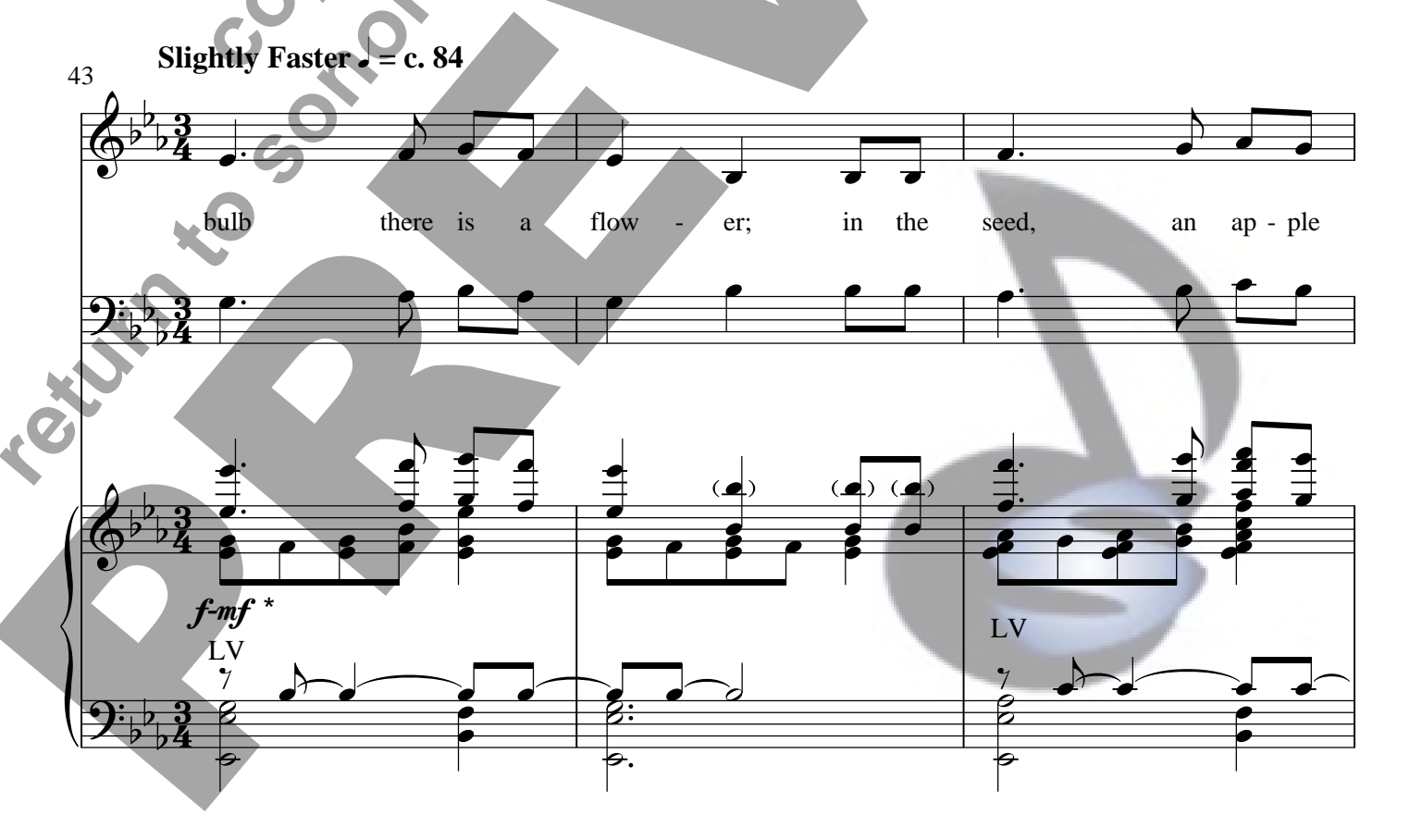
In His Hands - arr. McChesney - 3-5 Oct Handbell Choir with Optional SAB Choir - Page 6