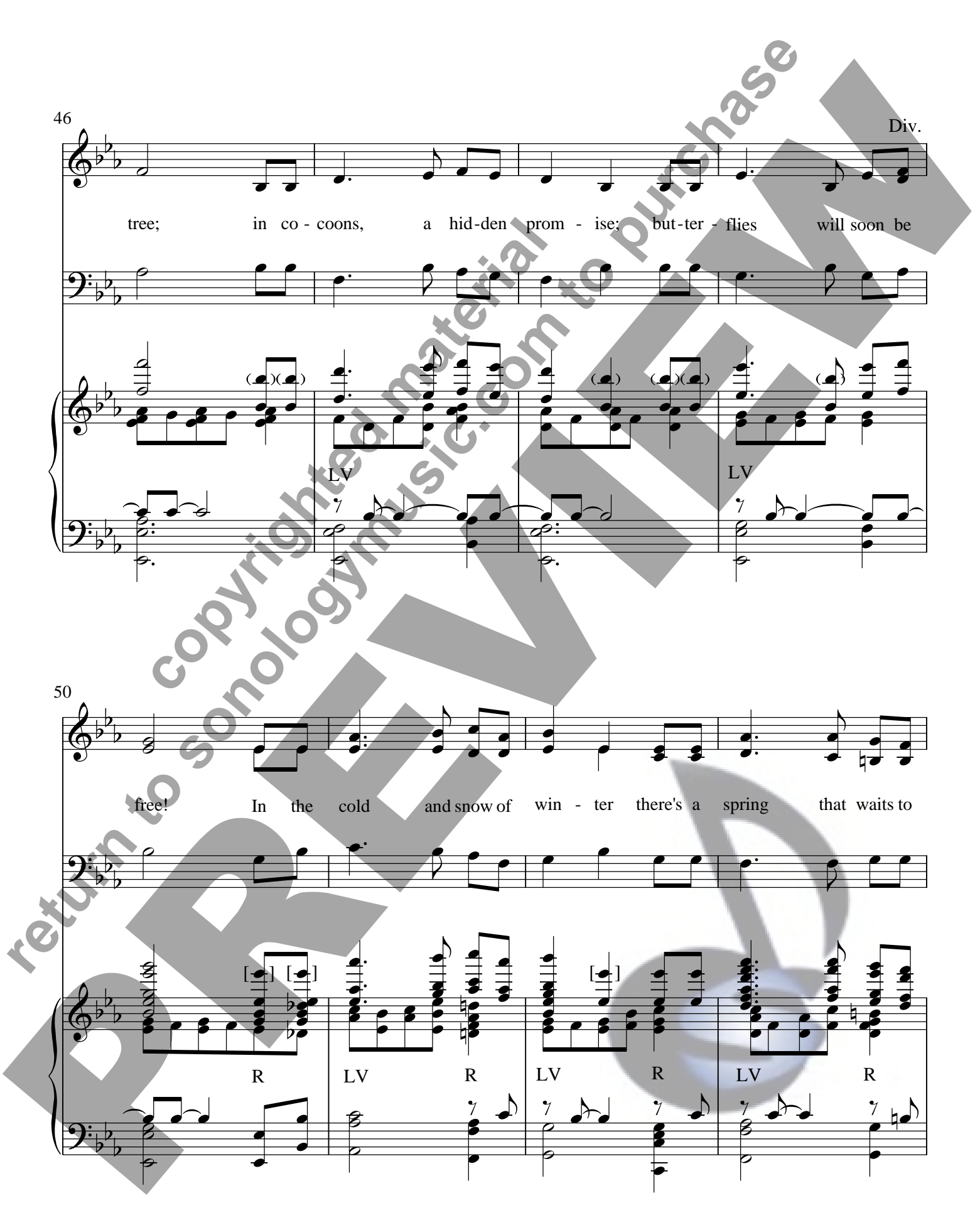
In His Hands - arr. McChesney - 3-5 Oct Handbell Choir with Optional SAB Choir - Page 7