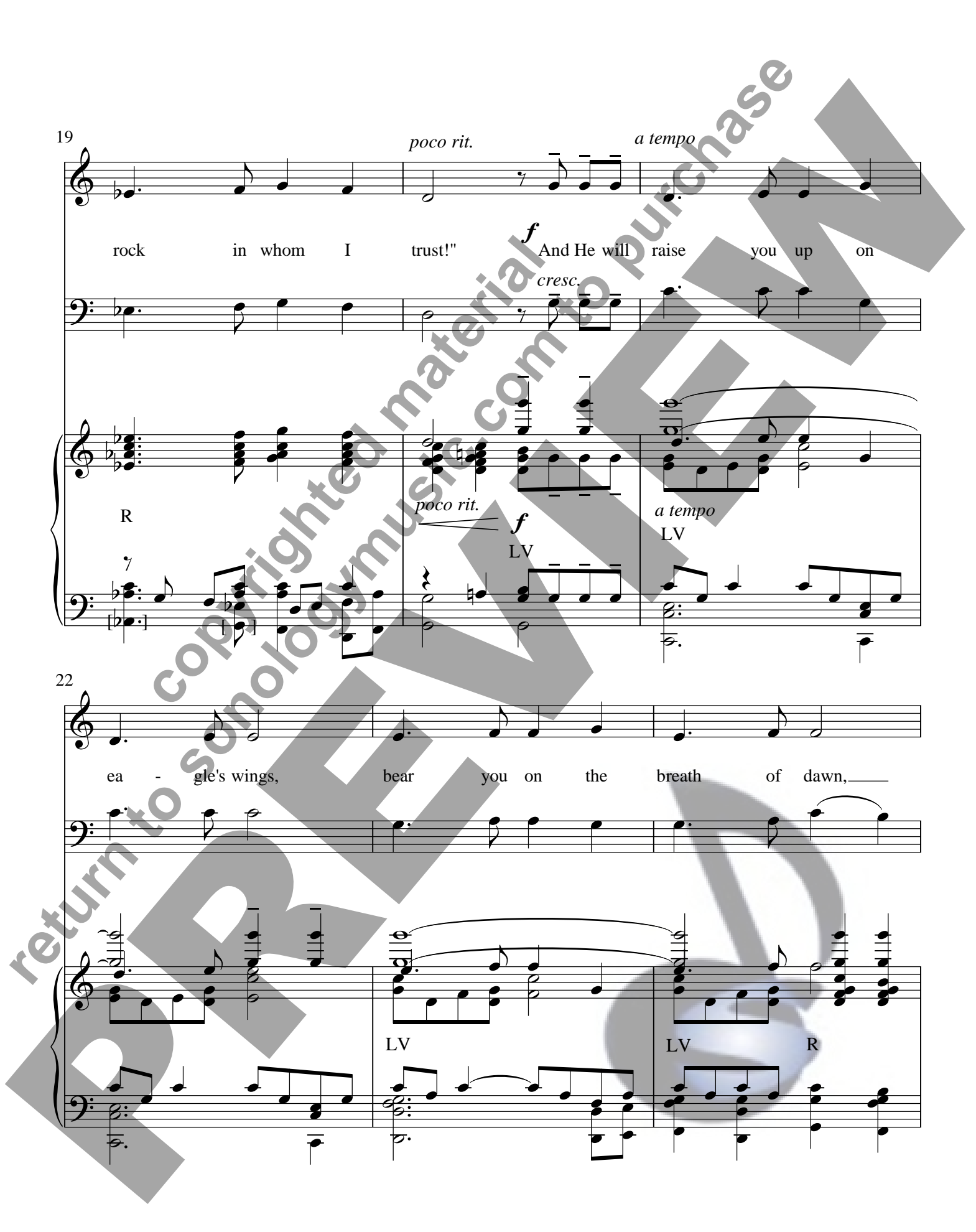
In His Hands - arr. McChesney - 3-5 Oct Handbell Choir with Optional Two-Part Mixed Choir - Page 3