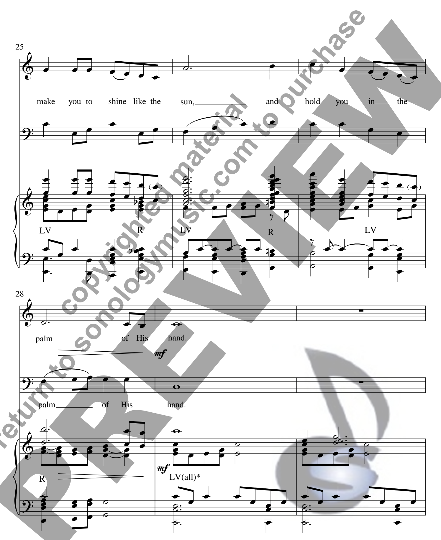
*All notes LV in m. 29-30 (as opposed to the common practice of having LV apply to the accompaniment while the melody or top voice rings and damps).