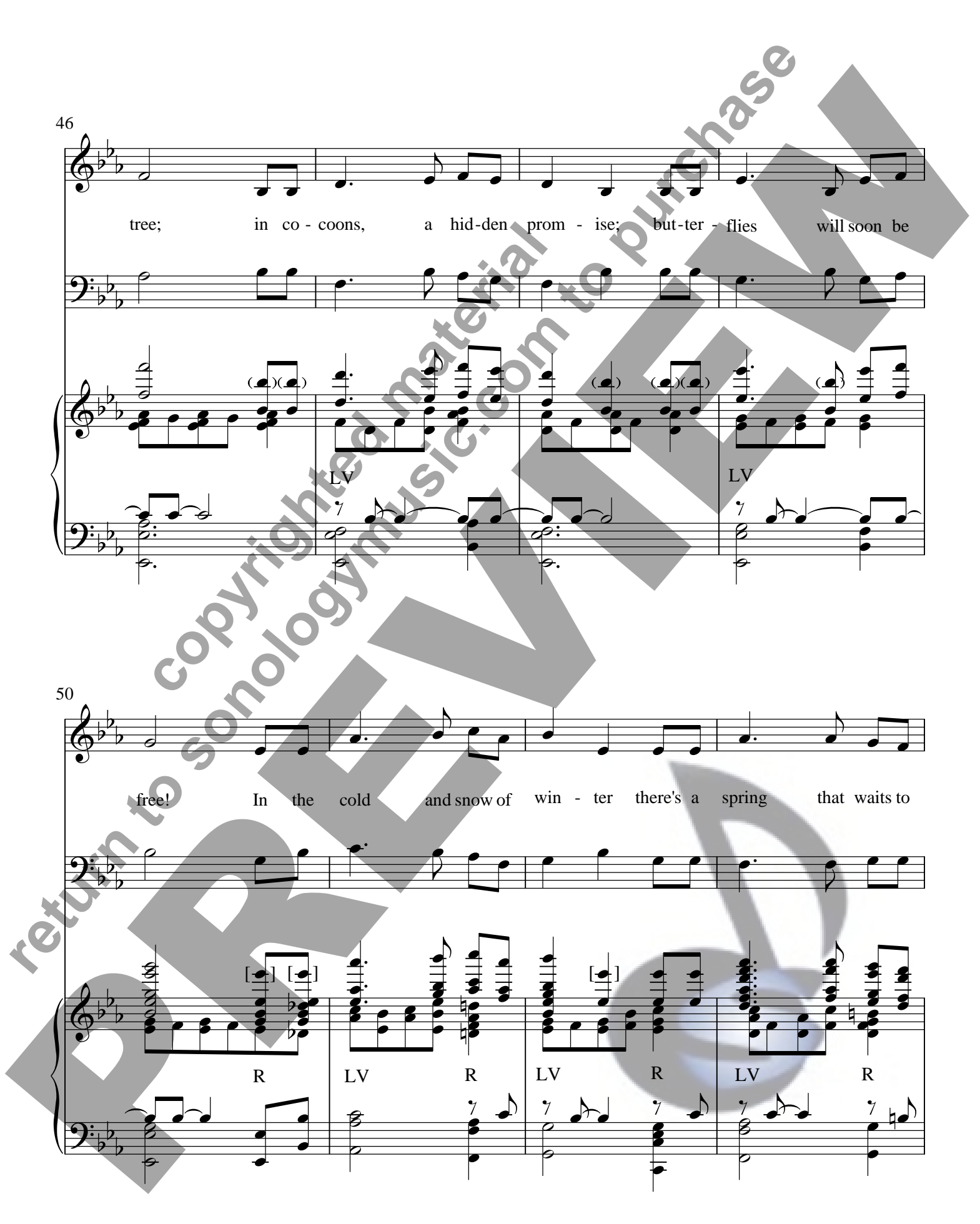
In His Hands - arr. McChesney - 3-5 Oct Handbell Choir with Optional Two-Part Mixed Choir - Page 7