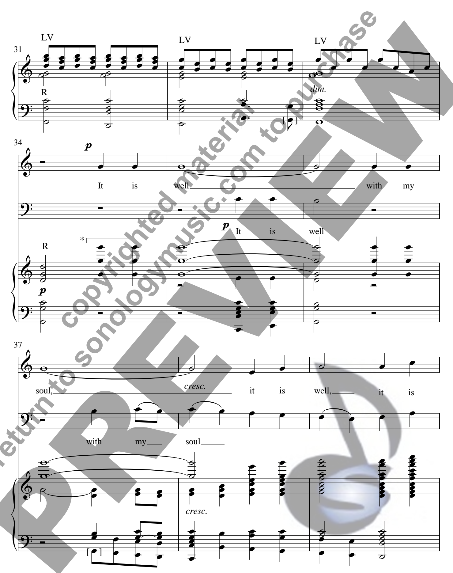
*Optional: Voices a capella (handbells tacet), m. 34 beat 3 through m. 41 beat 1. If using this option, handbells omit the whole note chord on beat 1 of m. 41 but play the rest of the notes in that measure.

In His Hands - arr. McChesney - 3-5 Oct Handbell Choir with Optional Two-Part Mixed Choir - Page 5