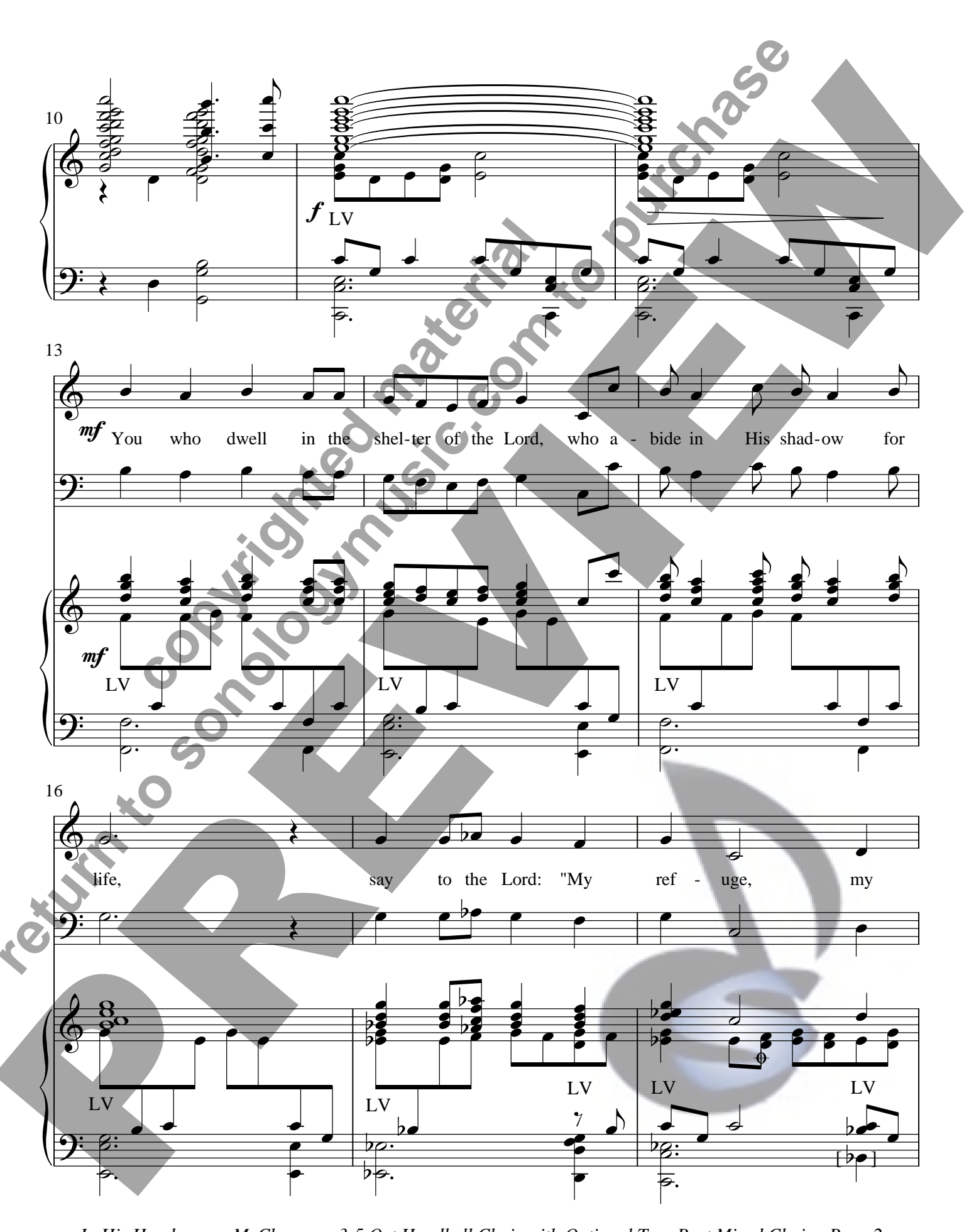
In His Hands - arr. McChesney - 3-5 Oct Handbell Choir with Optional Two-Part Mixed Choir - Page 2