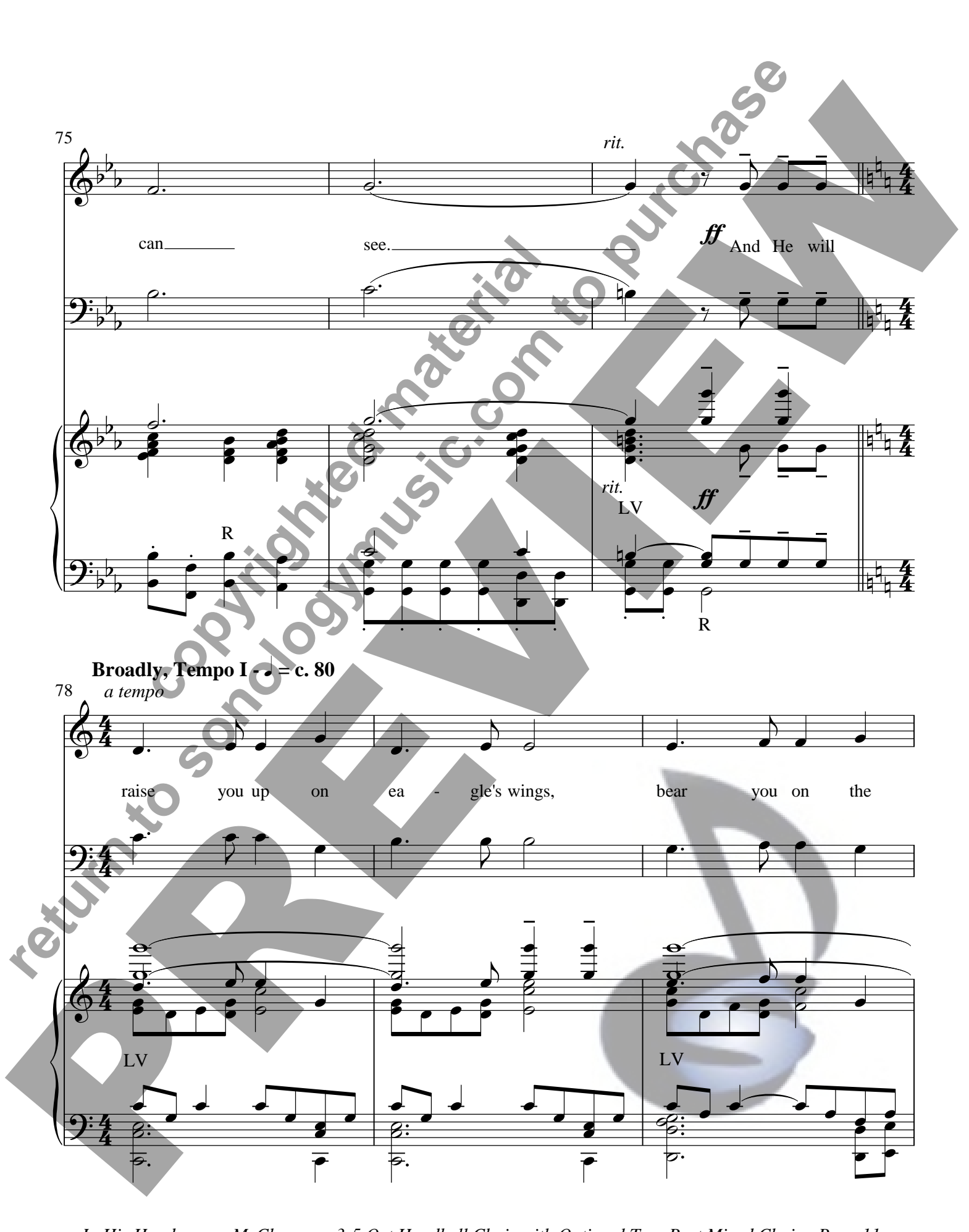
In His Hands - arr. McChesney - 3-5 Oct Handbell Choir with Optional Two-Part Mixed Choir - Page 11