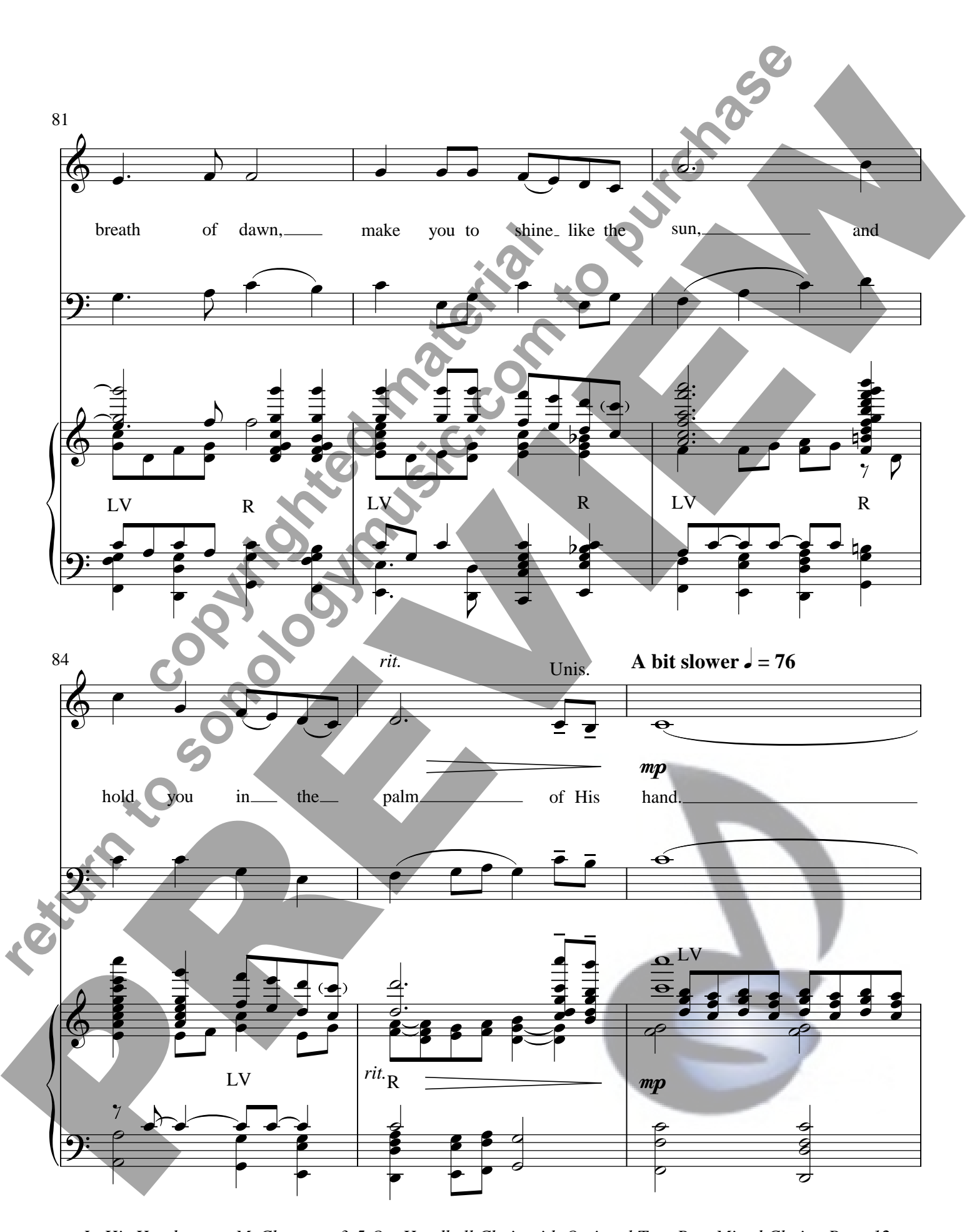
In His Hands - arr. McChesney - 3-5 Oct Handbell Choir with Optional Two-Part Mixed Choir - Page 12