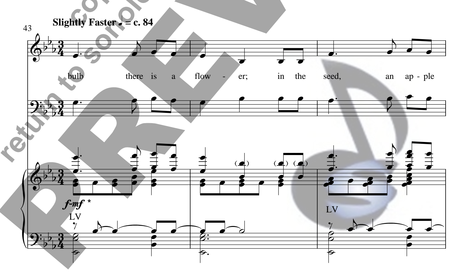
In His Hands - arr. McChesney - 3-5 Oct Handbell Choir with Optional Two-Part Mixed Choir - Page 6