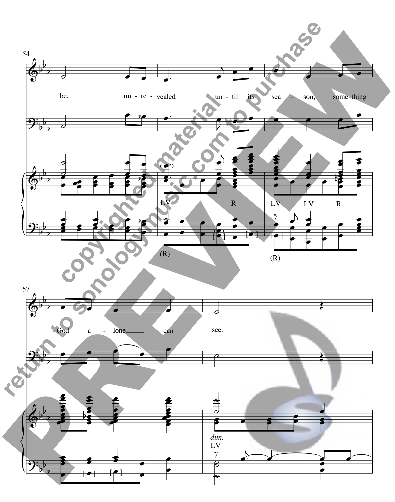
In His Hands - arr. McChesney - 3-5 Oct Handbell Choir with Optional Two-Part Mixed Choir - Page 8