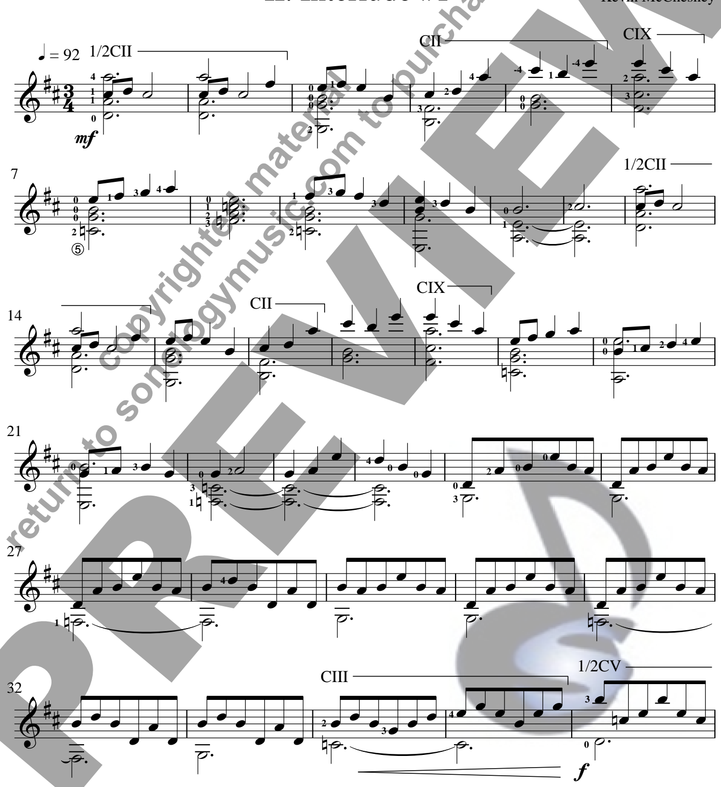
Copyright © 2005 - STEP All Rights Reserved. Copying Prohibited.