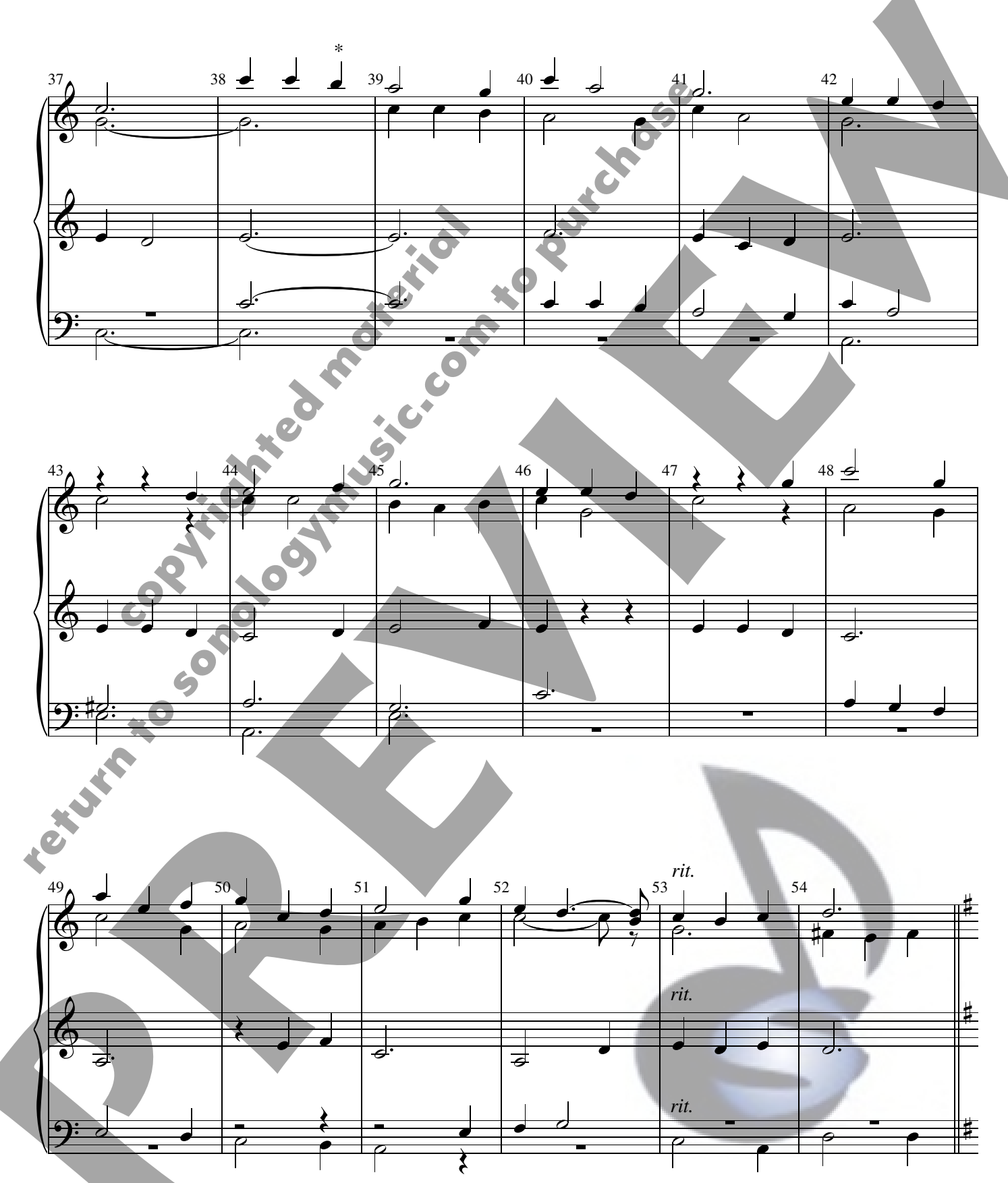
*If no duplicate B6 is available, hang B6 on end of handbell tree. This gives enough time for the B6 to be removed and rung (m. 30-38). Hang B6 back onto handbell tree when convenient for use in m. 84. Another alternative is to mallet this B6 very lightly while it is still on the handbell tree, striving to match the dynamics of the surrounding rung line as nearly as possible.