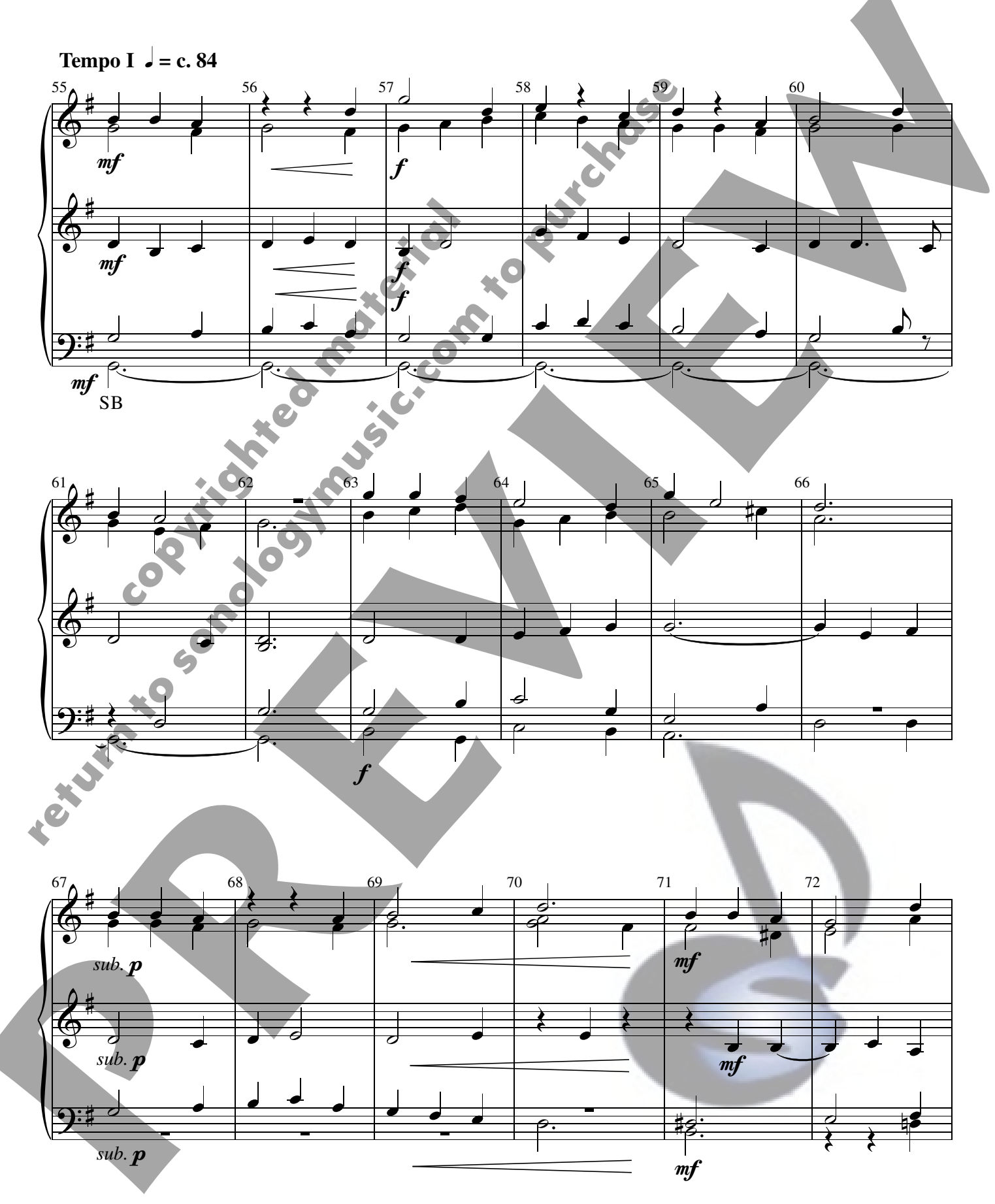
What \ Is \ This \ Lovely \ Fragrance? \ - \ arr. \ Hessemer \ - \ Handbell \ Quartet/Quintet \ - \ Page \ 5